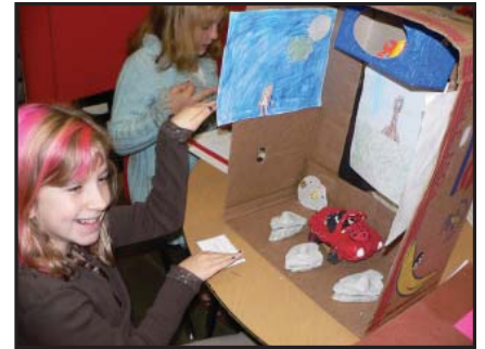
Never's clay word